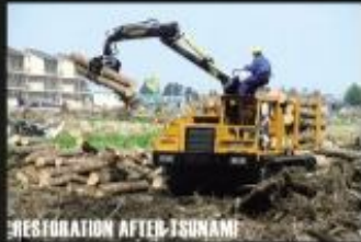
RESTORATION AFTER TSUNAMI