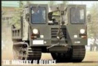
THE MINISTRY OF DEFENCE