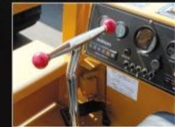
One driving lever for MST-300VD and MST-600VD