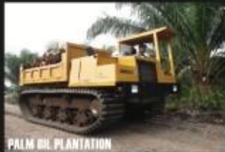
PALM OIL PLANTATION