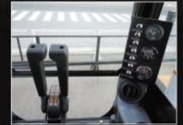
Two driving levers for MST-800VD, 1500VD, 2200VD and 3000VD